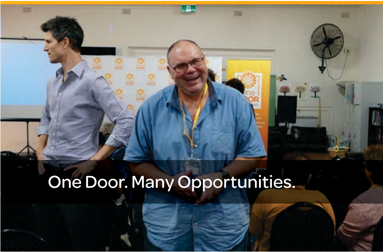
One Door. Many Opportunities.